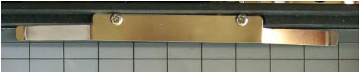
Ground glass retaining spring