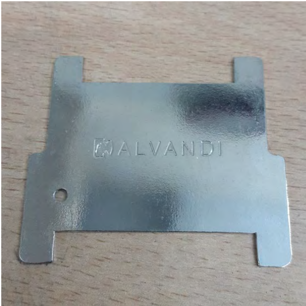
Exchange tool wrench for lens retaining rings 0/1 shutter