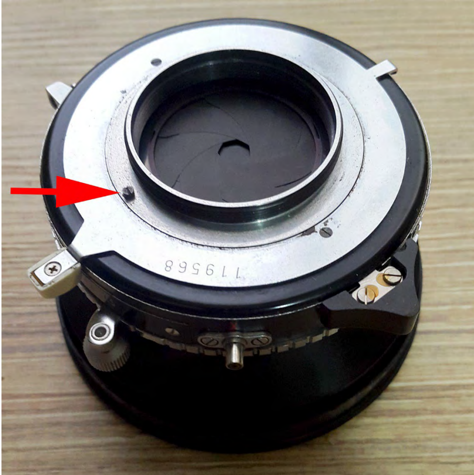
Remove the screw shown from the back of the shutter 0/1